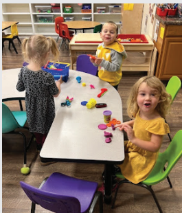
3K Children enjoy the timeless fun of play-doh and trains.

“Jesus said, ‘Let the little children come to me, and do not hinder them, for the kingdom of heaven belongs to such as these.’”