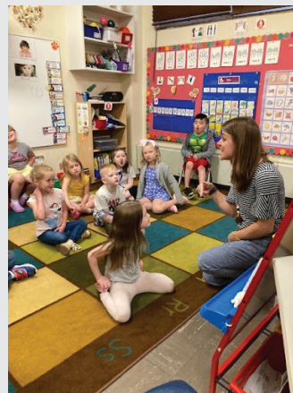
4K students learning the sound of "N"