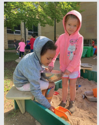
4K students enjoying the sun and sand