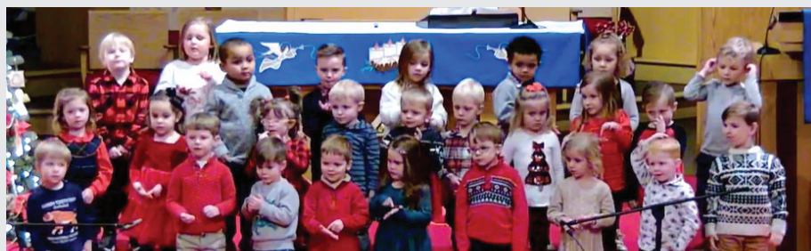
Preschool 3K Concert