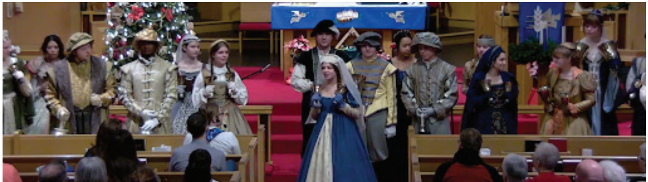
Those in attendance on December 18th were impressed by the harmonious voices of the Oshkosh North Madrigals.