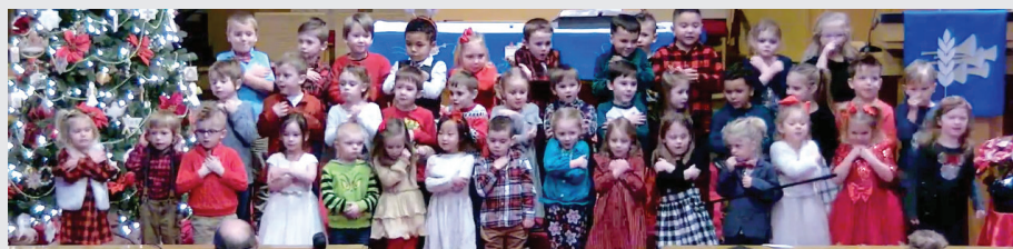
Preschool 4K Concert

“Jesus said, ‘Let the little children come to me, and do not hinder them, for the kingdom of heaven belongs to such as these.’”